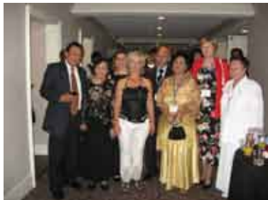
Ambassadors at the World Form